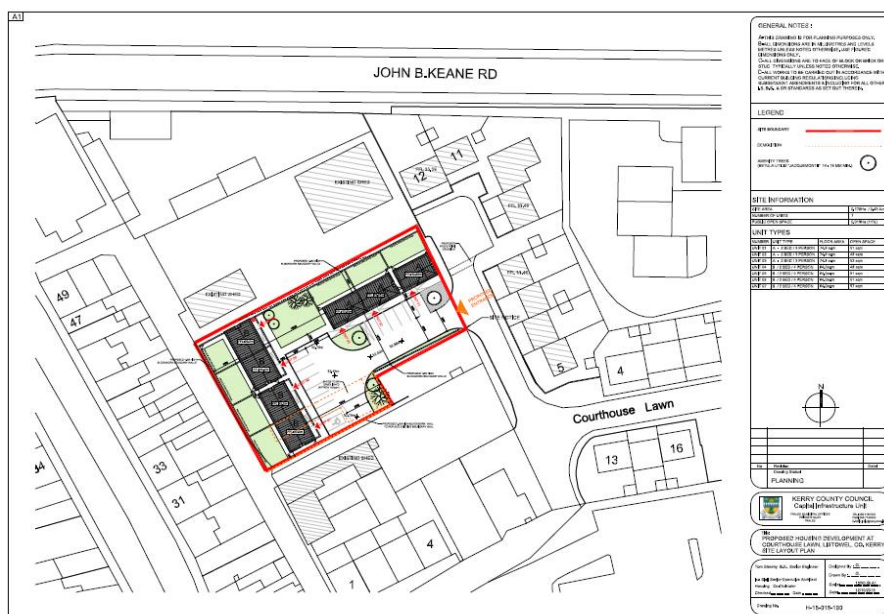
Figure 4: Site Layout Proposal that went on Public display on the 24 th January 2017. .