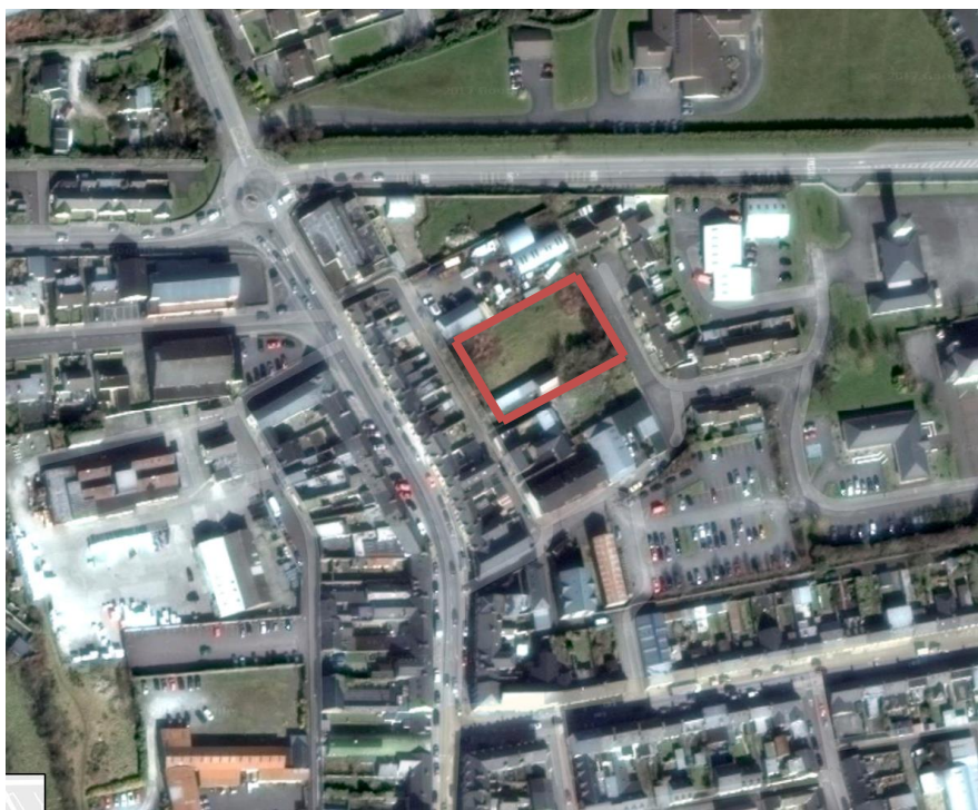
Figure 1: Ariel Photograph of proposed site highlighted in Red.

The project site is situated within Listowel Town Boundary in Courthouse Lawn to the rear of Upper William Street. Existing sheds are present on the South West of the lands. Vehicular access is via Charles Street. The site is situated within 500m of a choice of facilities, shops, public services and amenities. Existing two storey terrace units are noted to the west on Rear Upper William St., single storey units are constructed to the east and northeast and a commercial garage is operating to the North.