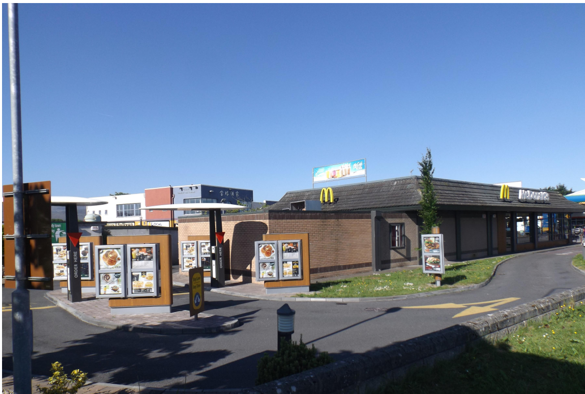
View of existing development from the adjoining public road