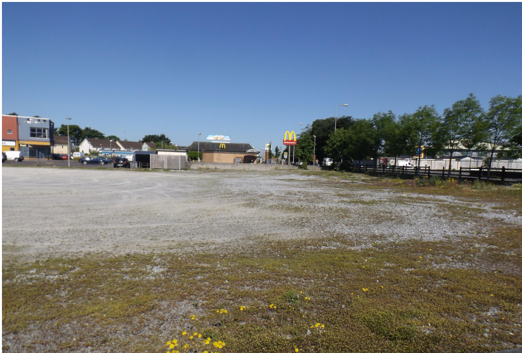
View of application site from the east