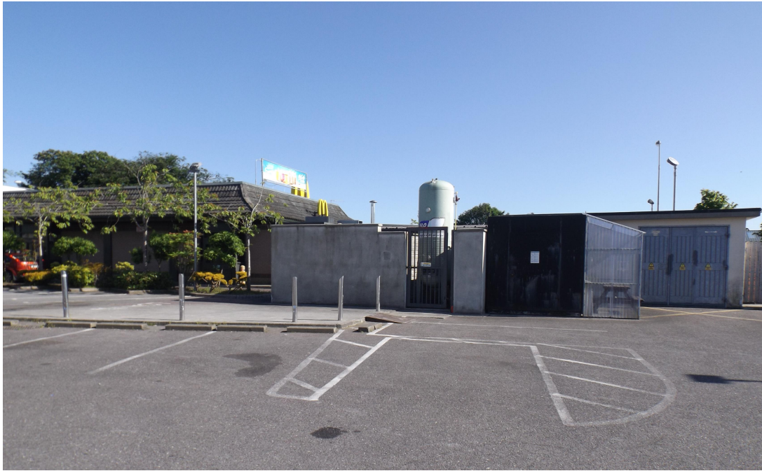
View of ancillary structures to the east of the existing restaurant