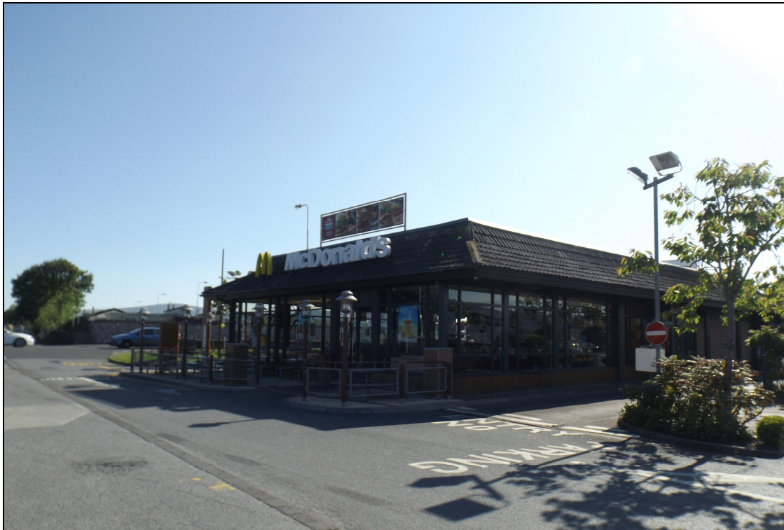
View from south-west of existing single-storey restaurant to be demolished