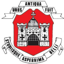
Limerick City Council