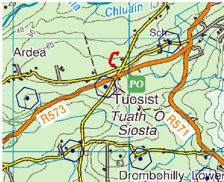
Recorded Monuments and Places in Tuosist