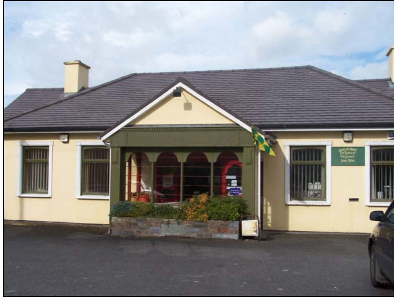
Figure 2: The existing shop/post office