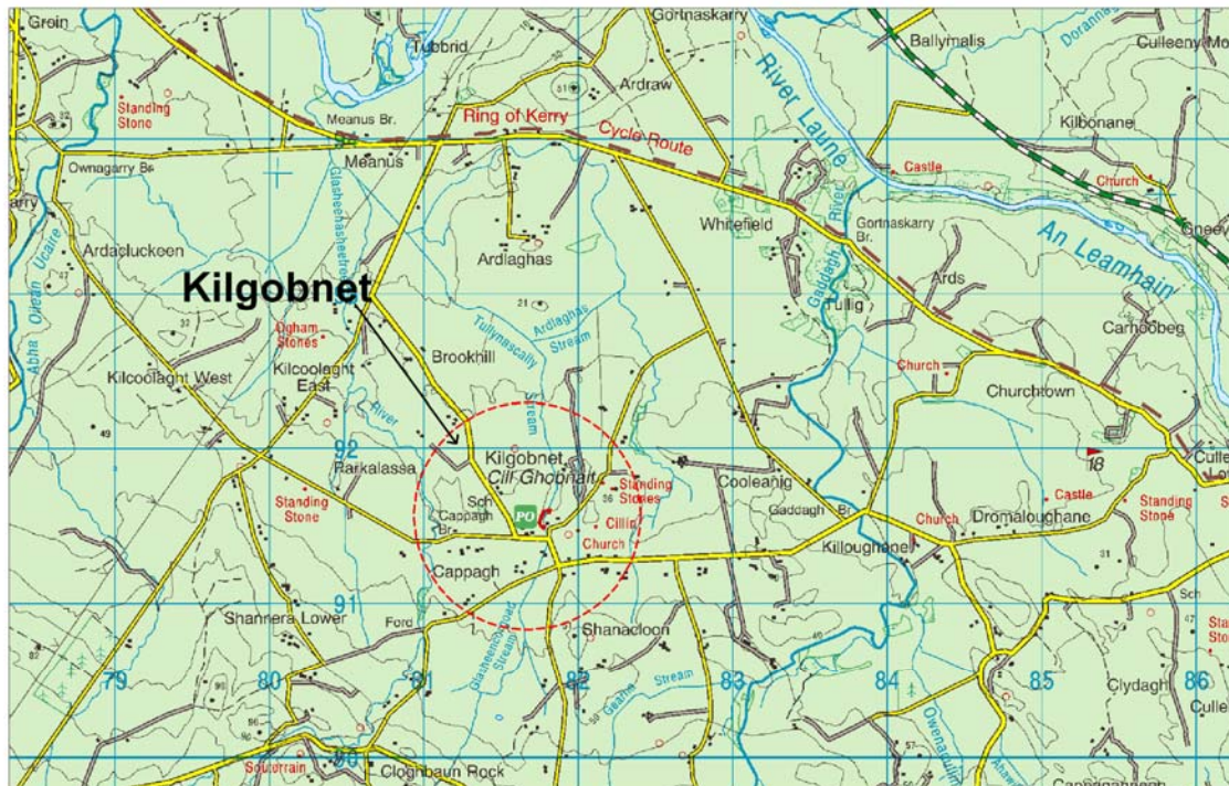
Figure 1: Location of Kilgobnet settlement

Kilgobnet (Cill Ghobnait) is a small rural settlement situated inland on the Iveragh Peninsula, approximately 7.5km southeast of Killorglin town and 5.5km west of Beaufort village. The settlement is situated at the foot of the McGuillycuddy reeks mountain range.