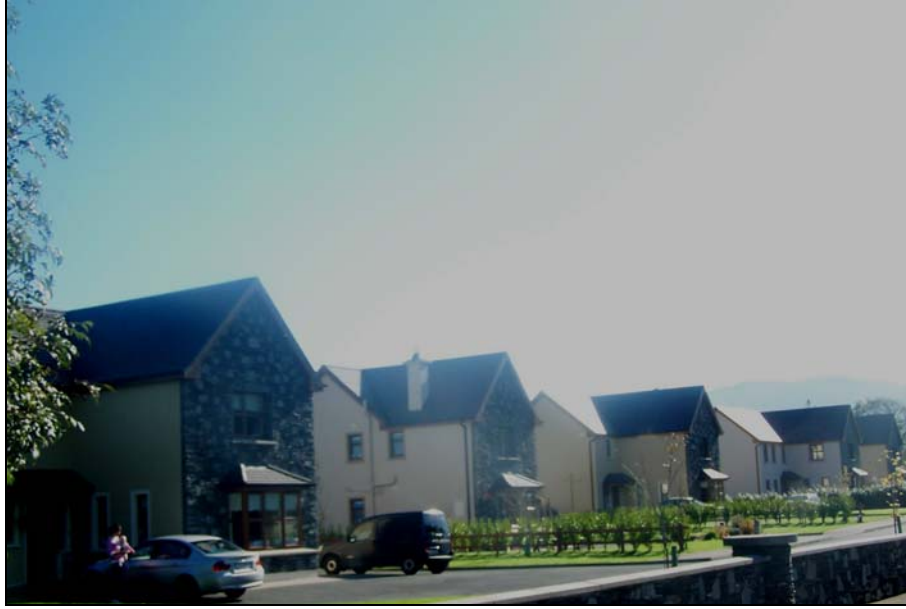
Figure 3: Kilgobnet close