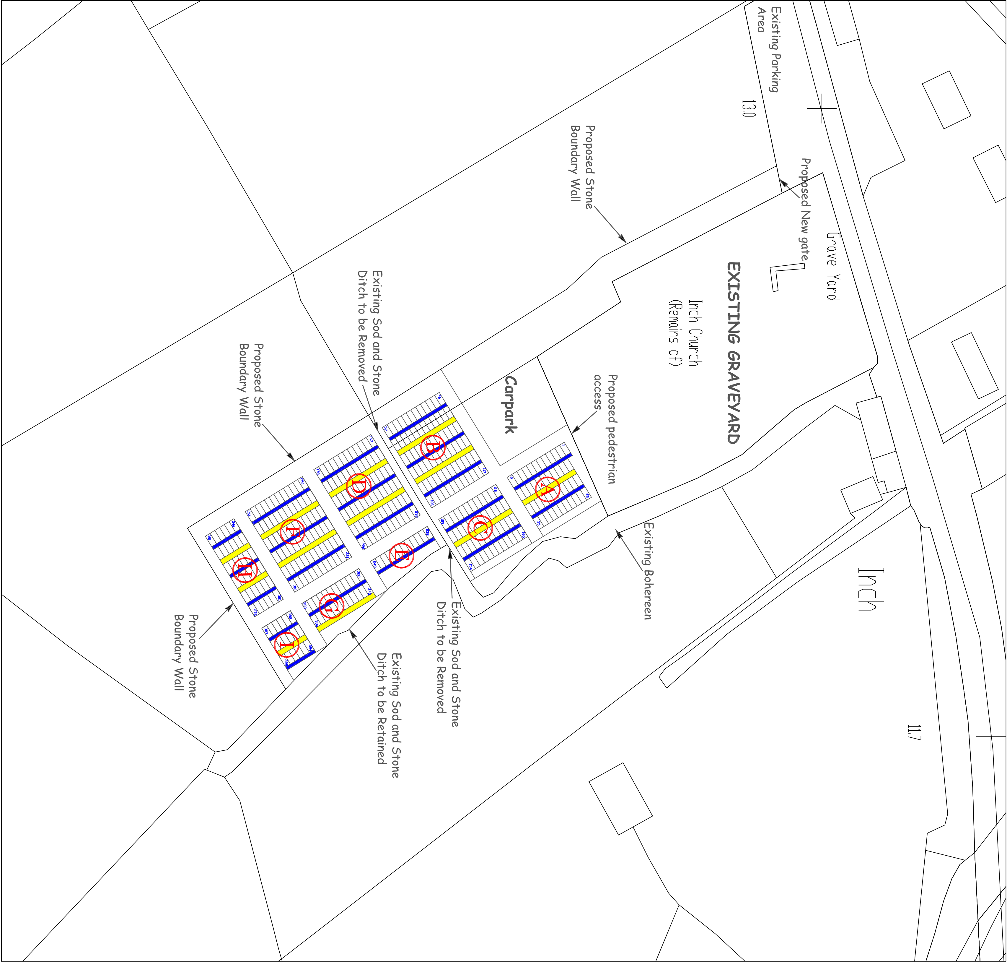
Site Layout Plan