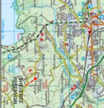
SITE LOCATION MAP 1:50000